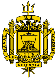
U.S. Naval Academy