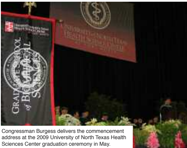
Congressman Burgess delivers the commencement address at the 2009 University of North Texas Health Sciences Center graduation ceremony in May.