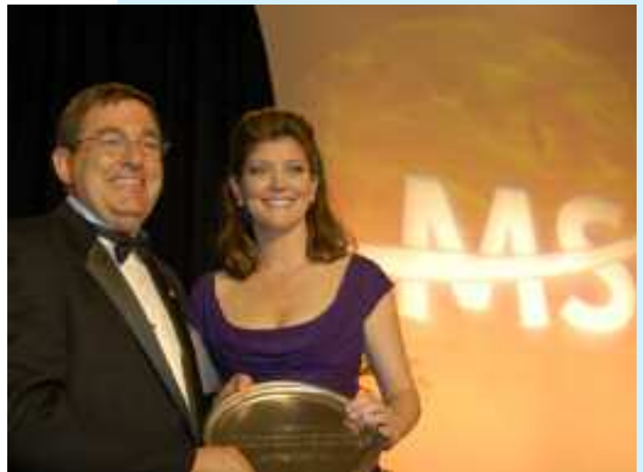
Norah O'Donnell, MSNBC's Chief Washington Correspondent and a member of the Multiple Sclerosis Society's National Capitol Chapter's Board of Directors presents Congressman Burgess with an award for his work on the issue of multiple sclerosis.