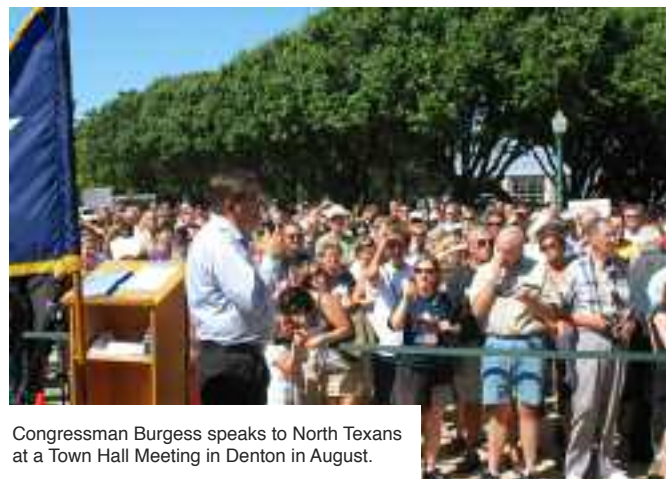
Congressman Burgess speaks to North Texans at a Town Hall Meeting in Denton in August.