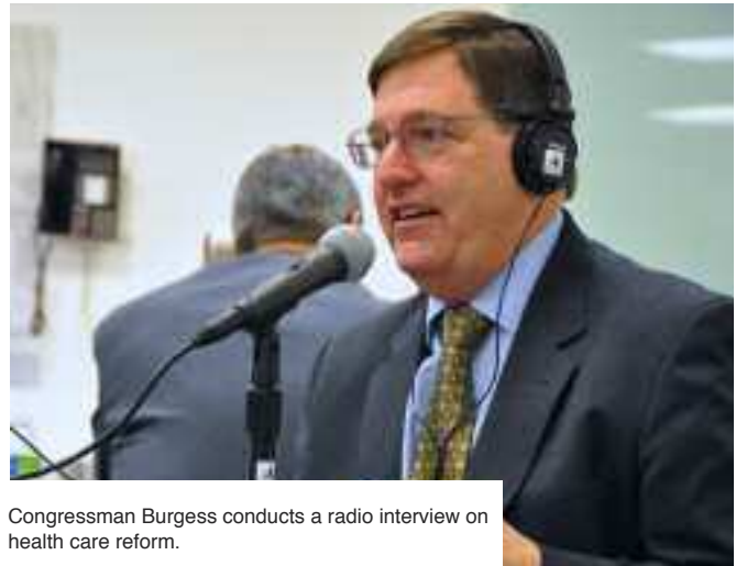
Congressman Burgess conducts a radio interview on health care reform.